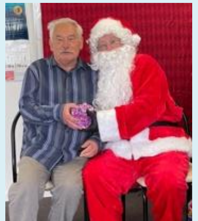
Must have got an amazing present !!