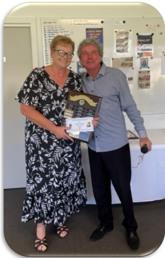
Open 2 Bowl Singles Champion