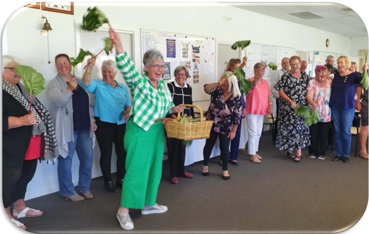
"RHUBARB, RHUBARB, RHUBARB" WAS THE VICTORY CALL TO UNSETTLE THE OPPOSITION