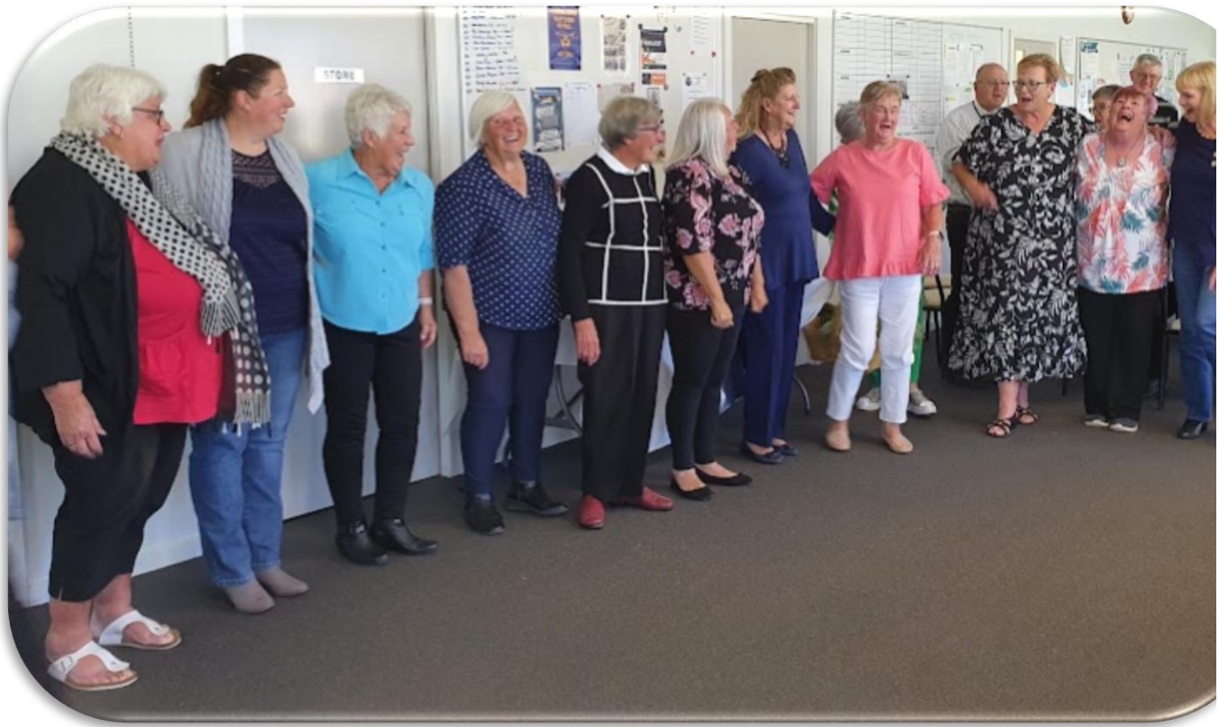
LADIES WENT THROUGH THE SEASON UNDEFEATED PREMIERS 2022/2023