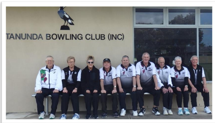
BOARD MEMBERS 2023/2024