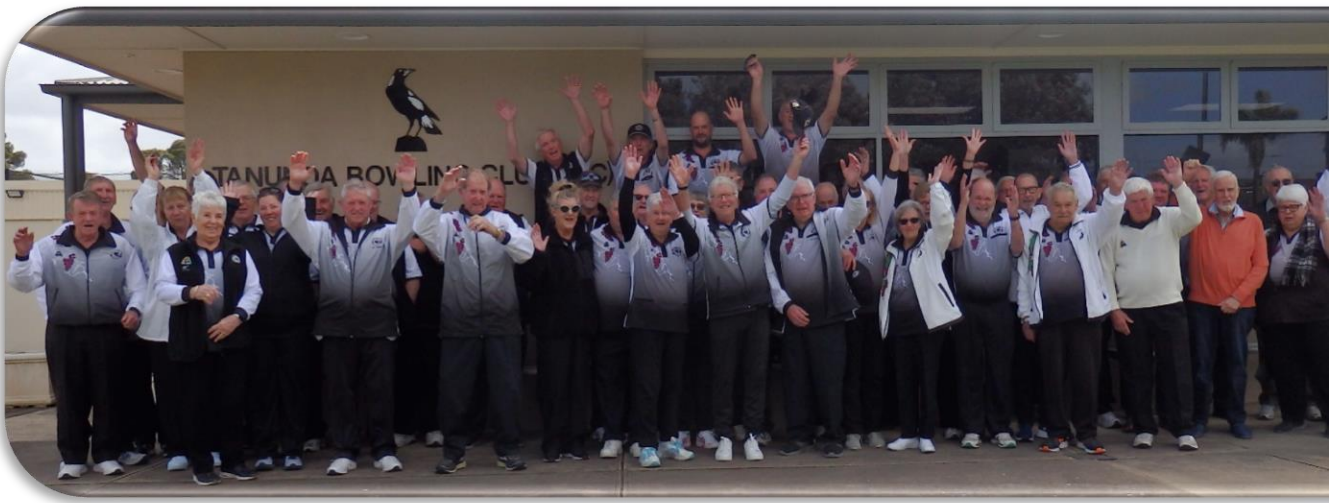
The group of 2024/2025 Pennant Season Bowlers